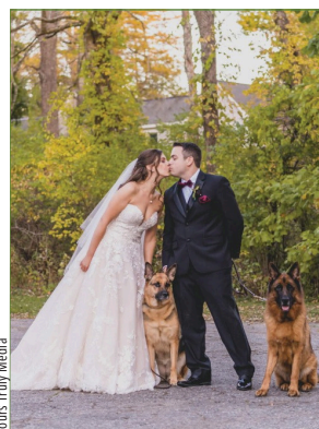
Yours Truly Media