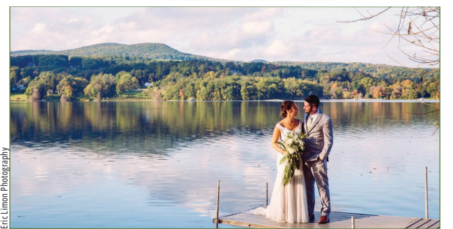
Eric Limon Photography