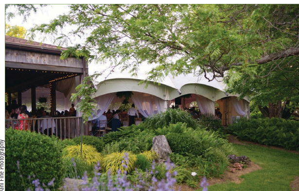
Dani Fine Photography