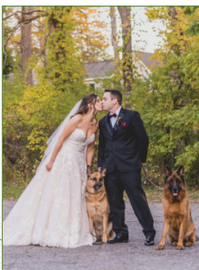
Yous Truly Media