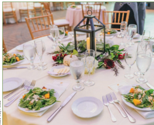
Yous Truly Media