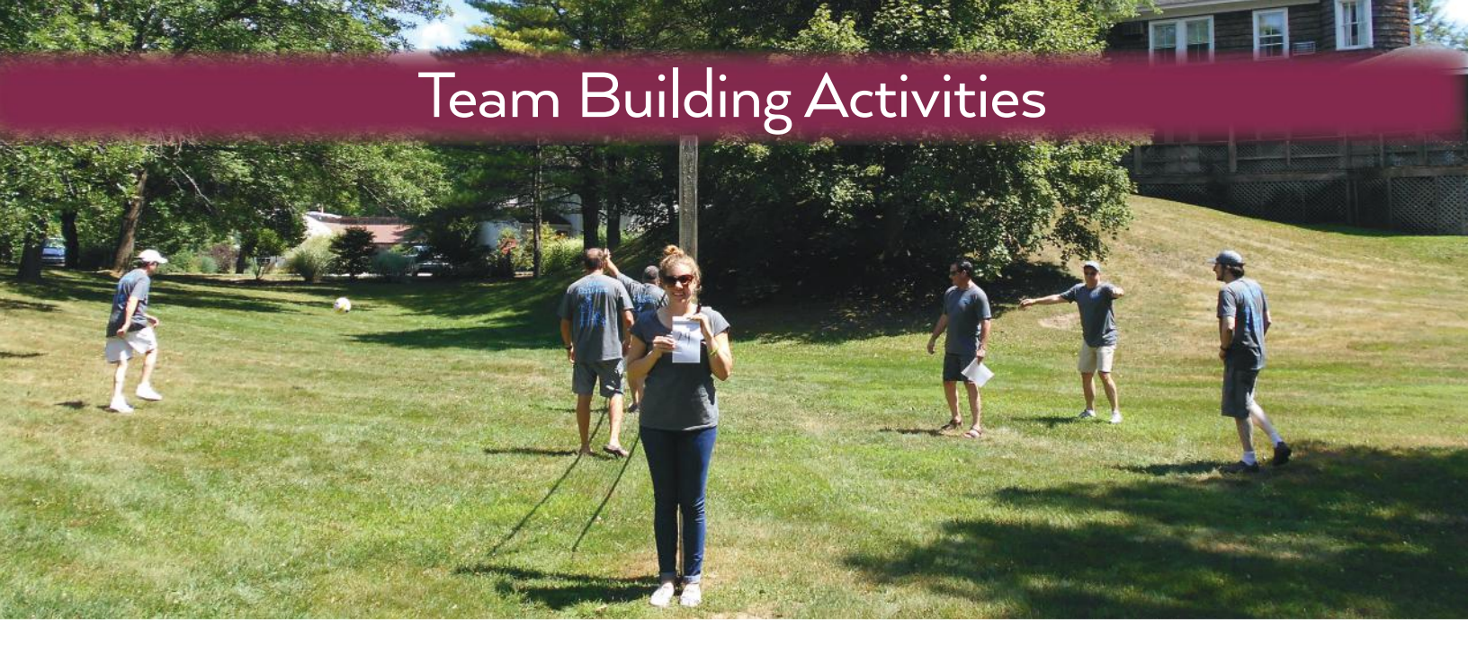
"The group is still talking about the photo safari and how much they enjoyed it!"